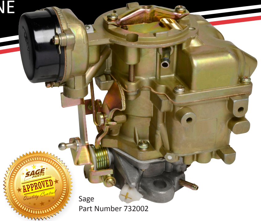
Sage Part Number 732002